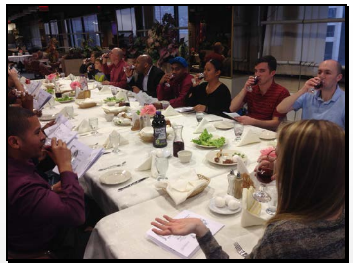
NATO and 425th Air Base Squadron members enjoy the Passover Seder Meal together that was hosted by the Izmir Liberty Chapel at the Izmir Club April 9, 2015.

The Talking Türkiye newsletter is published Fridays biweekly. Submission deadline for articles is COB Monday before the publication date; submission by deadline does not guarantee publication. All submissions must be e-mailed or provided on a computer disk in a document format. Articles are run at the discretion of the editorial staff on a space-available basis and are edited to reflect Air Force style and news format. News, feature and editorial material of the newsletter conforms to the Associated Press Style Book and Briefing on Media Law.