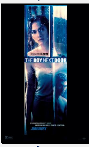
8 p.m. The Boy Next Door (R)

"The Woman in Black 2: Angel of Death" Plot Summary: 40 years after the first haunting at Eel Marsh House, a group of children evacuated from WWII London arrive, awakening the house's darkest inhabitant.