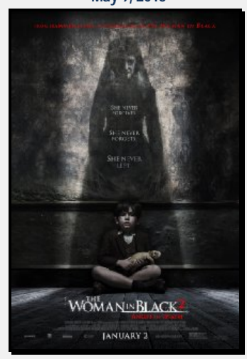
5.30 p.m. The Woman in Black 2 (PG-13)