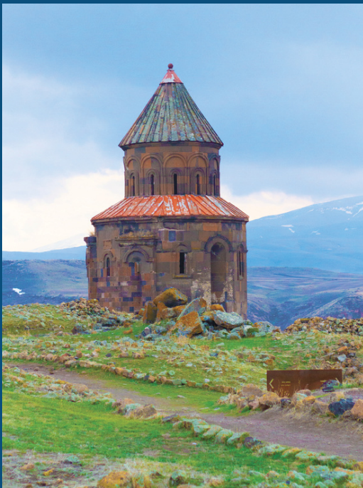
Church of Saint Gregory, Ani

If you're looking to have a clearer view of what you had just seen, then take the Balcova Cable Car, with its lower station located right across the Izmir Economy University. Referred to as the "Teleferik" by locals, the cable car brings to a hilltop where you can see spectacular views of the gulf and the city. Up there, a walking trail guides you to picnic and barbeque grounds overlooking the gulf and the Balcova Dam, in addition to a cafeteria and a shop where you can buy barbeque items among others.