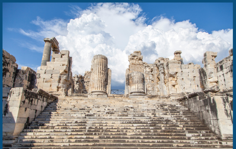
Apollo's Temple, Didim